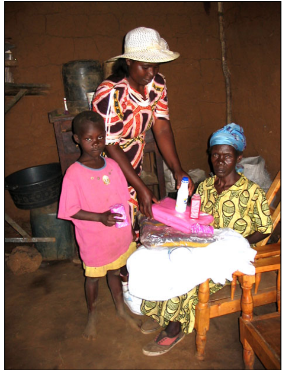
Provision of drugs by ICROSS CHW

The field team covered a wide area, a significant portion of Bungoma’s 2,000km 2 , a challenge which was not helped by the lack of vehicles. They were dependent on local buses (Matatus) and often had to walk several kilometres from a main road to a client’s house (most people return to their rural home when sick). The project leader worked closely with the ministry of health, encouraging access to drugs and testing and ensuring a successful handover of the programme once funding runs out.